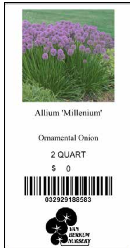
Custom Picture Tag